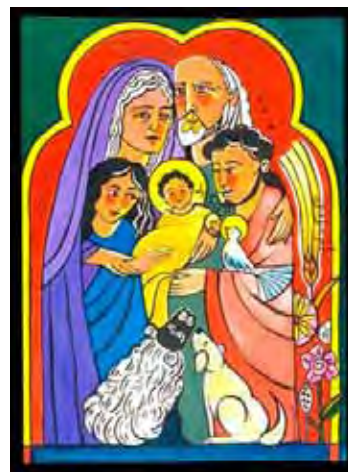
May St. Joachim and St. Anne, parents of Mary, Grandparents of Jesus bless you all the days of your life.

As we prepare ourselves through Advent for the celebration of Christmas, it is worth taking a moment to reflect on the role of St Joachim and St Anne in the Nativity. We know little about them but we know that as the parents of Mary, they nurtured her, taught her, and brought her up to be a worthy Mother of God - a young woman who 'found favour with the Lord'. Their teaching formed her, and led her to respond to God's invitation with a simple Fiat: "Let it be done to me according to your word." They must have been filled with wonder at the miracle of Jesus's conception and birth. Perhaps Mary followed their example of parenting as she brought up Jesus. Perhaps she asked them for help and advice. Their faith laid the foundations for the courage and strength Mary showed in standing with her son at the foot of the cross. They are an example to parents and Grandparents everywhere. As we move through Advent towards Christmas let us pray for their intercession as we ask for the graces to be parents and Grandparents like St Joachim and St Anne.