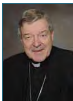
His Eminence Cardinal Pell

His Eminence Cardinal Pell launched the Australian chapter of the CGA. It was launched at a Mass in St Mary's Cathedral in Sydney on December 1st. Cardinal Pell was the chief celebrant. He gave a homily which described the genesis of the CGA, and highlighted the vital contribution that Grandparents make to the family, the Church and to Society. It is hoped that individual parish groups will gradually spring up throughout Australia.